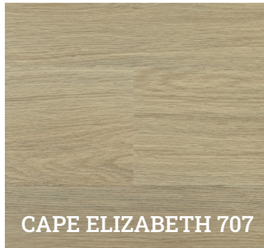
CAPE ELIZABETH 707