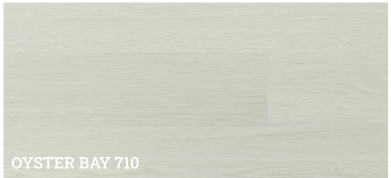
OYSTER BAY 710