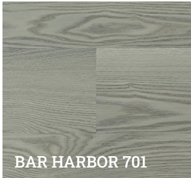
BAR HARBOR 701